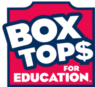
Box Tops for SMM

You can find all sale dates and SCRIP order days on the school calendar .